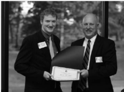
Winning alumni award —