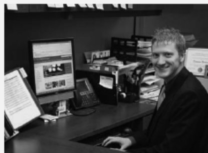
— and working to win